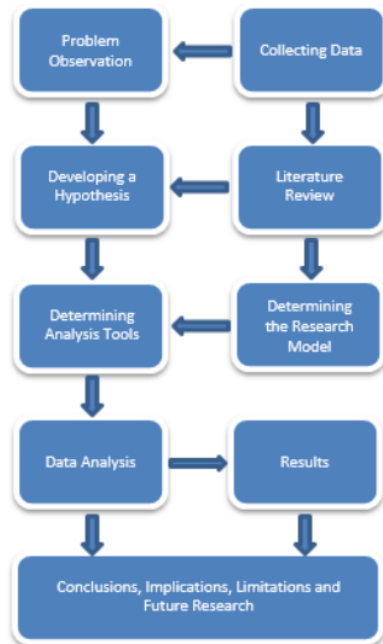
Figure 1. Research flowchart

This research is inductive research, and the research process is conducted through several steps in accordance with the rules of inductive research. These steps are presented in a flowchart diagram, as shown in Figure 1.