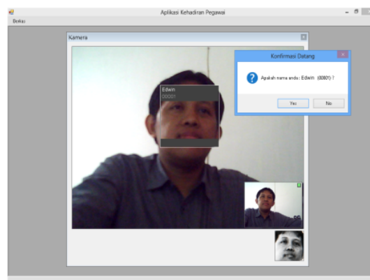
Fig. 3. The interface of the face recognition-based attendance system

The face recognition system on the proposed attendance machine can produce accuracy between 90% -96% on the use of feature extraction using PCA. The use of CNN-PCA in the proposed search can produce an accuracy of between 90% -98%. An attendance system based on face recognition using CNN-PCA can work better than using only PCA.