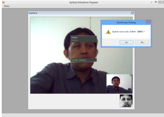
Fig. 4. Facial recognition model in the face attendance system