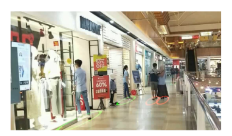
Figure 5. Test image 2

The first digital test results were carried out with a few people first, as shown in Figure 4. This test was carried out with a small number of people, and the standard camera position was parallel to humans. The distance between the camera and the object is 3 to 4 meters. The success rate in the first test for human detection using Yolo-v5 reached 100%. Judging by this success rate, the Yolo-v5 can accurately detect tiny and precise humans, as well as standard camera positions. Then the accuracy of social distancing detection reaches 100%. Judging from the picture, that two people violate social distancing, then detected by the system by showing an indicator that turns red.