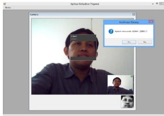
Fig. 3. The interface of the face recognition-based attendance system

The face recognition system on the proposed attendance machine can produce accuracy between 90% -96% on the use of feature extraction using PCA. The use of CNN-PCA in the proposed search can produce an accuracy of between 90% -98%. An attendance system based on face recognition using CNN-PCA can work better than using only PCA.