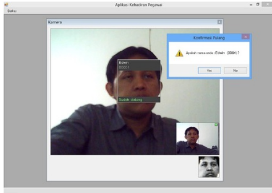
Fig. 4. Facial recognition model in the face attendance system