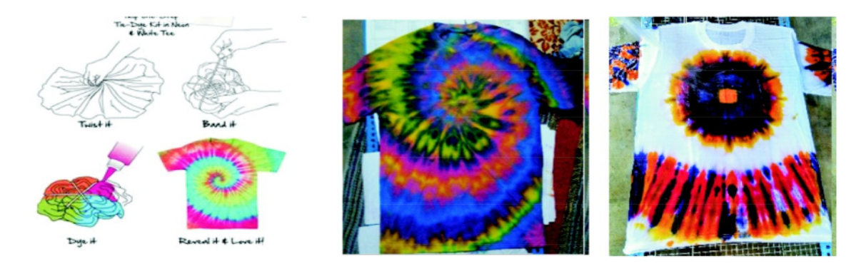
Figure 1.1. Tie Dye Technique

The assistance strategies were implemented for the craftsmen of Semarangan batik using new techniques which can be used as the alternatives in the process of coloring and batik motif. They were usually called tie dye technique, smock technique, and the use of the natural color of mangrove and bixa to produce unique batik product which can be a regional uniqueness.