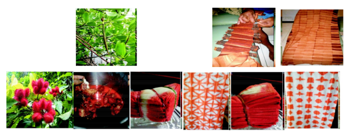
Figure 1.3: Batik Motif using the techniques and tie dye and Smock with the natural dyeing of Mangrove and BIXA