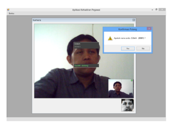
Fig. 4. Facial recognition model in the face attendance system