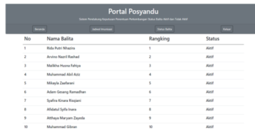
Figure 3. Toddler Status Page

The final results of each toddler in table 16 will be sorted from the highest score to the lowest score. After sorting the final results, then a ranking will be given to toddlers from 1 onwards. While the results of the calculation of the classification of each toddler from table 9 will be taken the final result in the form of active or inactive status. For more details can be seen in figure 3.