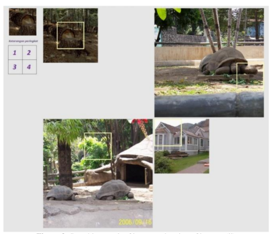
Figure 3. Searching result of image and region of interest (ii)