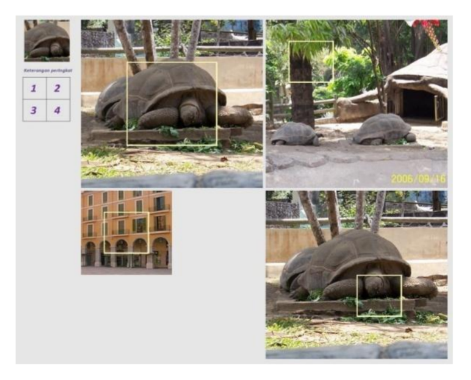
Figure 2. Searching result of image and region of interest (i)

with ROI in size of 128X128 [9]. If it is observed then ROI of image data on the first rank is the most similar to the query image.