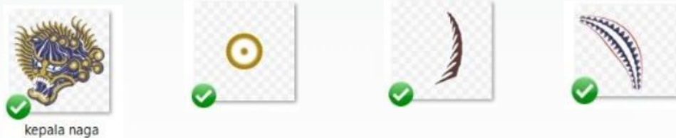
The Head of a Dragon The body of a dragon The first scale of a dragon The second scale of a dragon

The researchers used fractal algorithm on the defining stage by grouping the motif, Warak Ngendog, into some parts. They are the body of a dragon, in the form of circle with a central point, the first scale of a dragon, the second scale of a dragon, and the head of the dragon. The fractal implementation in batik motif facilitates other motif development. It has the main function as reference to explore various motifs without neglecting the main motif elements (Figure 1.2)