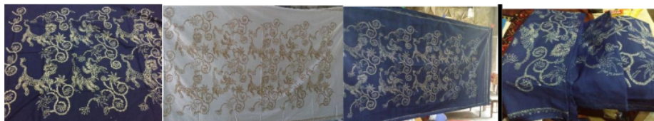
Figure 1.5 the Result of Fractal batik Motif in Written Batik Garment Commodity with Natural Dyes.

The test of literature-based motif creation that is formed from the main data to create Warak Ngendok motif could produce various contemporary motifs. They can be applied on batik garment products (figure 1.5). The produced motifs were varied and unique.