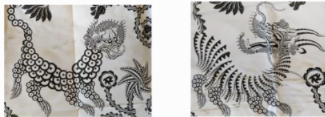
Figure 1.4 the Result of L-System algorithm uses to draw Warak Ngendok motif.

Letter "F", in terms of fractal, commands to "DRAW THE DRAGON'S BODY." The concept on the third stage will draw three dragon's bodies. "S" is a "COMMAND." This alphabet does not produce figure. Only "F" refers to "DRAW THE DRAGON'S BODY." The final stage from all stages, such as definition, iteration, and substitution is complemented with the uses of mathematical function. It facilitates the implementation of L-System to create batik with "Warak Ngendok" motif. The addition of function + [plus] and - [minus] maximize the duplication, iteration, and shiftiness processes to produce an animal figure motif completely (Figure 1.4) based on the demanded algorithm.