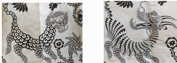
Figure 1.4 the Result of L-System algorithm uses to draw Warak Ngendok motif.

Letter "F", in terms of fractal, commands to "DRAW THE DRAGON'S BODY." The concept on the third stage will draw three dragon's bodies. "S" is a "COMMAND." This alphabet does not produce figure. Only "F" refers to "DRAW THE DRAGON'S BODY." The final stage from all stages, such as definition, iteration, and substitution is complemented with the uses of mathematical function. It facilitates the implementation of L-System to create batik with "Warak Ngendok" motif. The addition of function + [plus] and - [minus] maximize the duplication, iteration, and shiftiness processes to produce an animal figure motif completely (Figure 1.4) based on the demanded algorithm.