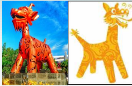
Figure 1.1 The Symbol of Warak Ngendog as the Fractal Batik Motif Foundation (source: the author, 2020).

The researchers used fractal algorithm on the defining stage by grouping the motif, Warak Ngendog, into some parts. They are the body of a dragon, in the form of circle with a central point, the first scale of a dragon, the second scale of a dragon, and the head of the dragon. The fractal implementation in batik motif facilitates other motif development. It has the main function as reference to explore various motifs without neglecting the main motif elements (Figure 1.2)