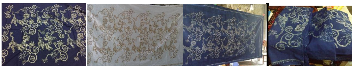
Figure 1.5 the Result of Fractal batik Motif in Written Batik Garment Commodity with Natural Dyes.

The test of literature-based motif creation that is formed from the main data to create Warak Ngendok motif could produce various contemporary motifs. They can be applied on batik garment products (figure 1.5). The produced motifs were varied and unique.