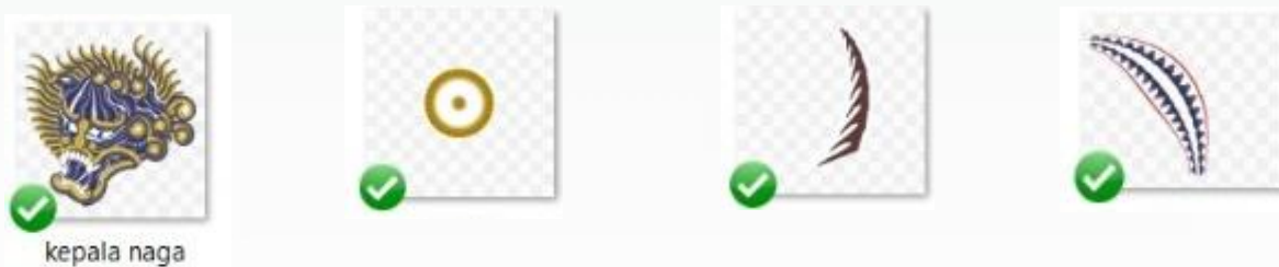
The Head of a Dragon The body of a dragon The first scale of a dragon The second scale of a dragon

The researchers used fractal algorithm on the defining stage by grouping the motif, Warak Ngendog, into some parts. They are the body of a dragon, in the form of circle with a central point, the first scale of a dragon, the second scale of a dragon, and the head of the dragon. The fractal implementation in batik motif facilitates other motif development. It has the main function as reference to explore various motifs without neglecting the main motif elements (Figure 1.2)