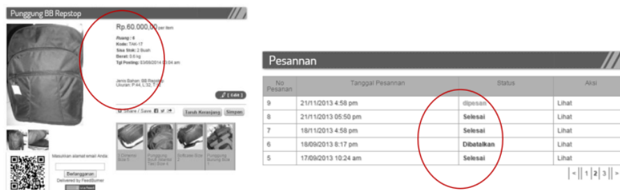
Figure 3. Example of e-Commerce Coding Control (left) and Order Control (Right)

The purpose of Input Controls is to ensure that the valid transaction data is complete, collected totally and free of errors prior to processing. Control to input to be entered into a computer is done at data collecting and data entry steps. It is designed to ensure that a wide range of SME e-commerce transactions is valid, accurate, and complete. Input control consists of control to source documents, data encoding, data batch, validation, input errors, and common data input system.