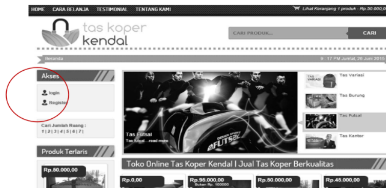
Figure 5. Access Login Control